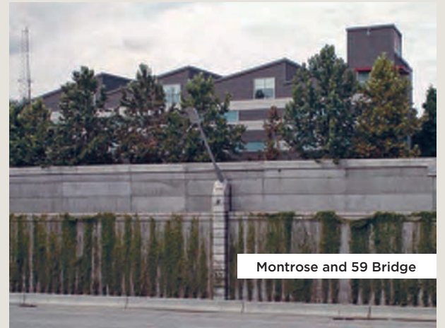
Montrose and 59 Bridge