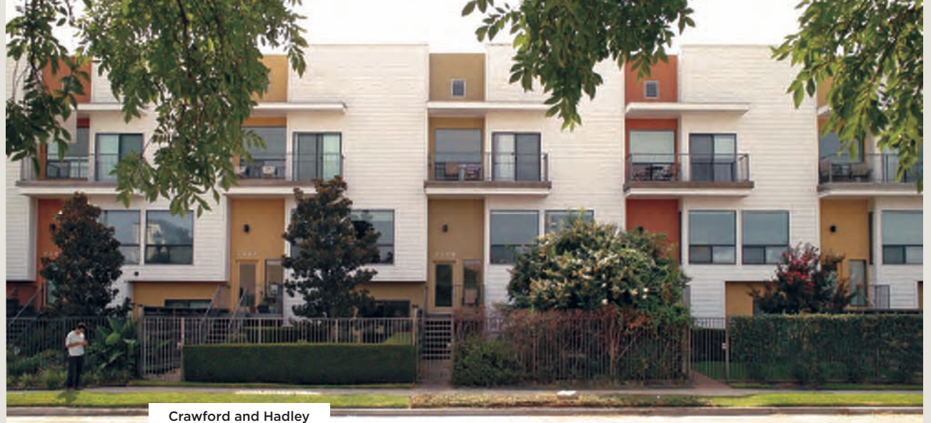
Crawford and Hadley

City Promenade (completed 2002-06) in Midtown features a generous common space between units with trees planted down the middle. It can serve as a place for people to hang out, not just drive into their units and turn on the TV.