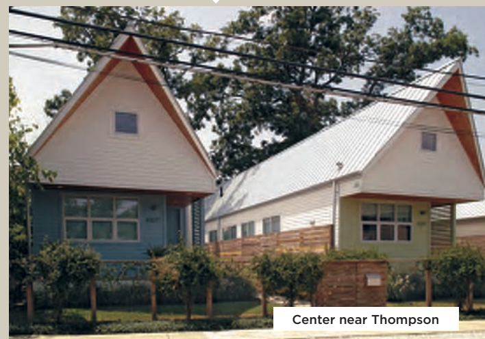
Center near Thompson