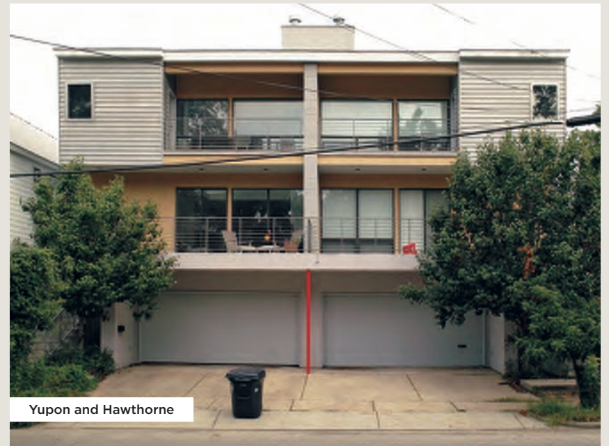
Yupon and Hawthorne