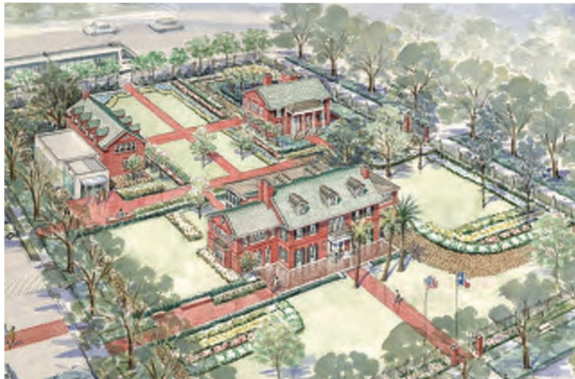
Aerial rendering of Clayton House, guest house, and garage showing rehabilitation and additions.

Most of the rooms in the house have been altered to support the functions of a library. Reading rooms and meeting rooms, which long ago had been living rooms, were rehabilitated in keeping with the restrained detail of the original house. Muted paint colors join walls and paneling together, bringing a cohesiveness and modernity to the whole space. Enhanced by the natural