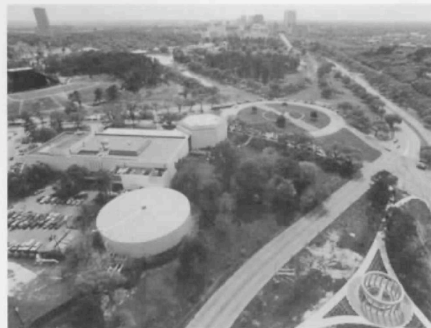
Find the water tank in this picture.