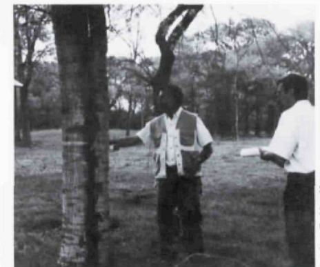
Flood control district workers mark trees that stand in the right-of-way on the Sims Bayou project, in order to relocate them.

tration's Clean Water Act, land users are required to "mitigate" wetland acreage that is developed; in other words, if ten acres of wetlands are to be developed, ten acres of new wetlands must be created to replace them. Rather than have countless small and possibly inefficient wetland sites scattered around on different developments, Storey proposes a much larger mitigation wetland in the general area under consideration, built and funded by individual developers and based on a system of credits, appraisals, and fees. Both the private sector and municipalities