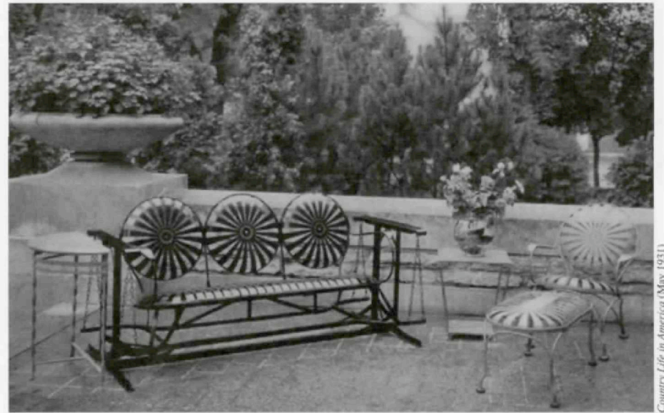
French edition of "resilient tempered steel finished in rustproof lacquer of any desired color."

In spite of its outstanding features, the cushioned glider of the 1930s is a rarity today. Variations continued to be available through the Sears catalogue until 1964, but the frames of the postwar models were more often aluminum than sturdy steel. Changing American ways of life no longer accommodated or demanded the particular features of the cushioned glider. Maintenance had always been a problem. Cushions mildewed; springs rusted. Television began to lure more and more people inside, off their porches, as did the chilling novelty of air conditioning. Gliders are still manufactured and sold today, but they are wooden, metal, or plastic and lack cushions. Wooden gliders first appeared in the Sears catalogue in 1937, and all-metal cushionless gliders appeared in 1942. Though they lack the comfort of cushions and springs, both types are still serviceable for short periods of time. Aesthetically, the advent of the all-metal glider provided back and seat surfaces ideal for an astounding variety of punched and molded patterns – stars, basketweaves, rosettes, and