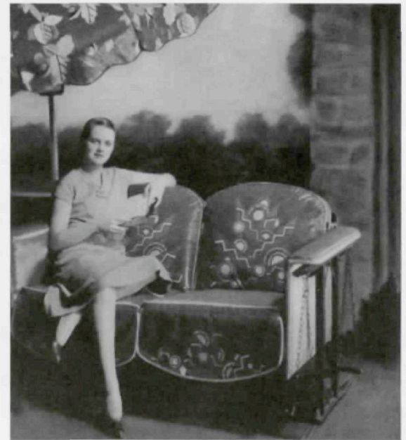
Permatex-covered lawn umbrella and glider by Troy Sunshade Company.

P ORCH swings are pleasant, and rocking chairs are relaxing, but for me the pinnacle of porch seating is the cushioned glider of the 1930s. I encountered the perfect glider on the cool brick floor of a screened room, referred to as "the breezeway," attached to my grandparents' house in the country outside of Waxahachie. The breezeway was oriented to the prevailing wind and was bordered on two sides by a trellised walkway covered with honeysuckle, which made it the coolest space in the whole countryside. However, at the height of a Texas summer, before air conditioners became common in rural areas, even the coolest space was not exactly comfortable unless you were reclining on a cushioned glider. The slightest push of your big toe could produce both a breeze and the blessed, smooth, gliding motion that gave this inspired but unassuming piece of furniture its name.