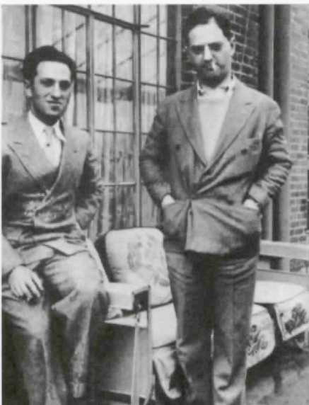
Upholstered roof-top glider modeled by George (left) and Ira Gershwin.

The use of the term "glider" for this new type of seating furniture first appeared around 1930. Other forms of the verb glide , which does perfectly describe the distinctive smooth, swinging motion of a glider, can be found several years earlier.