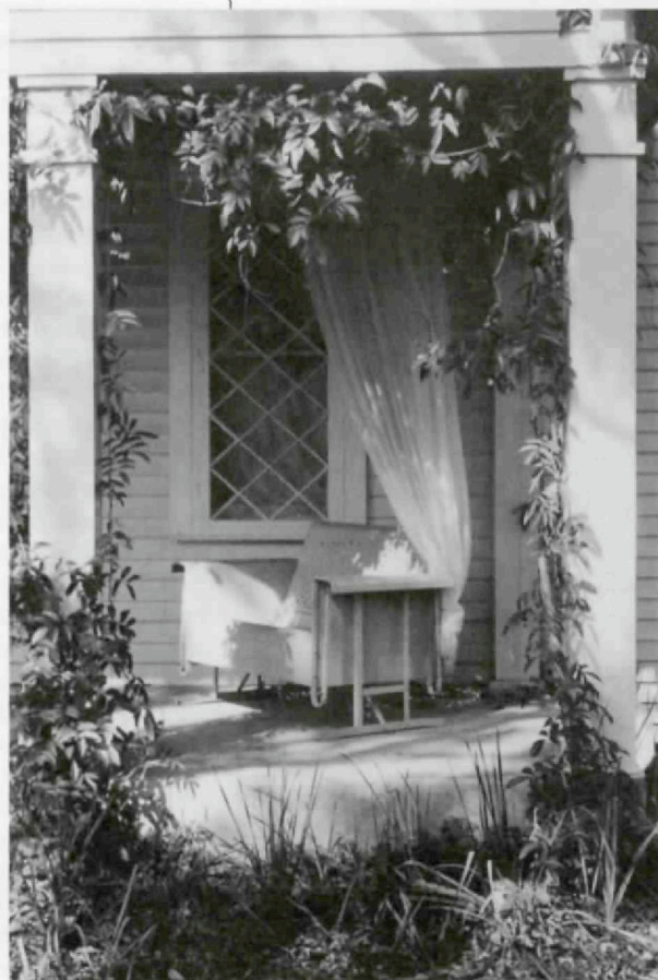
Front porch glider with mosquito netting, Magnolia Grove subdivision, Houston, Texas.

The desire for both movement and comfort in a free-standing, movable piece of outdoor furniture that culminated in the invention of the glider produced a host of other delightful, if not totally successful, creations. Among them were the "Comfort