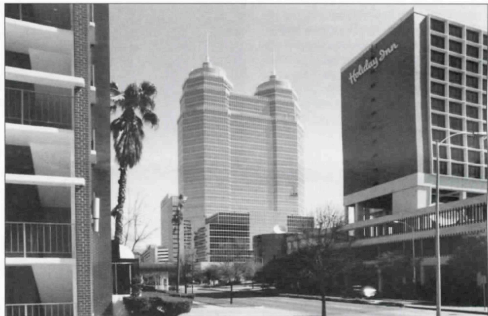
St. Luke's Medical Tower, 1990, Cesar Pelli & Associates and Kendall/Heaton Associates.

floor 9 is an ambulatory surgery center. The remaining floors, 13 through 25, are tenant floors, with mechanical space above the 25th floor and in the basement.