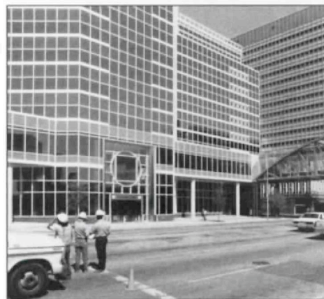
Detail of Fannin Street entrance and walkway bridge.

These exteriors enclose approximately 483,000 gross square feet of hospital and tenant office space as well as parking for 1,350 automobiles. The building's first two floors contain the entry and elevator lobbies, waiting rooms, retail space, and access ramps to the lower three and upper six garage floors. Saint Luke's Episcopal Hospital occupies floors 9 through 12;