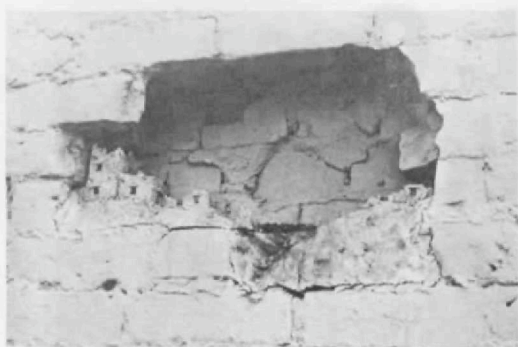
Charles Simonds, (Untitled), Downtown Houston, 1982.