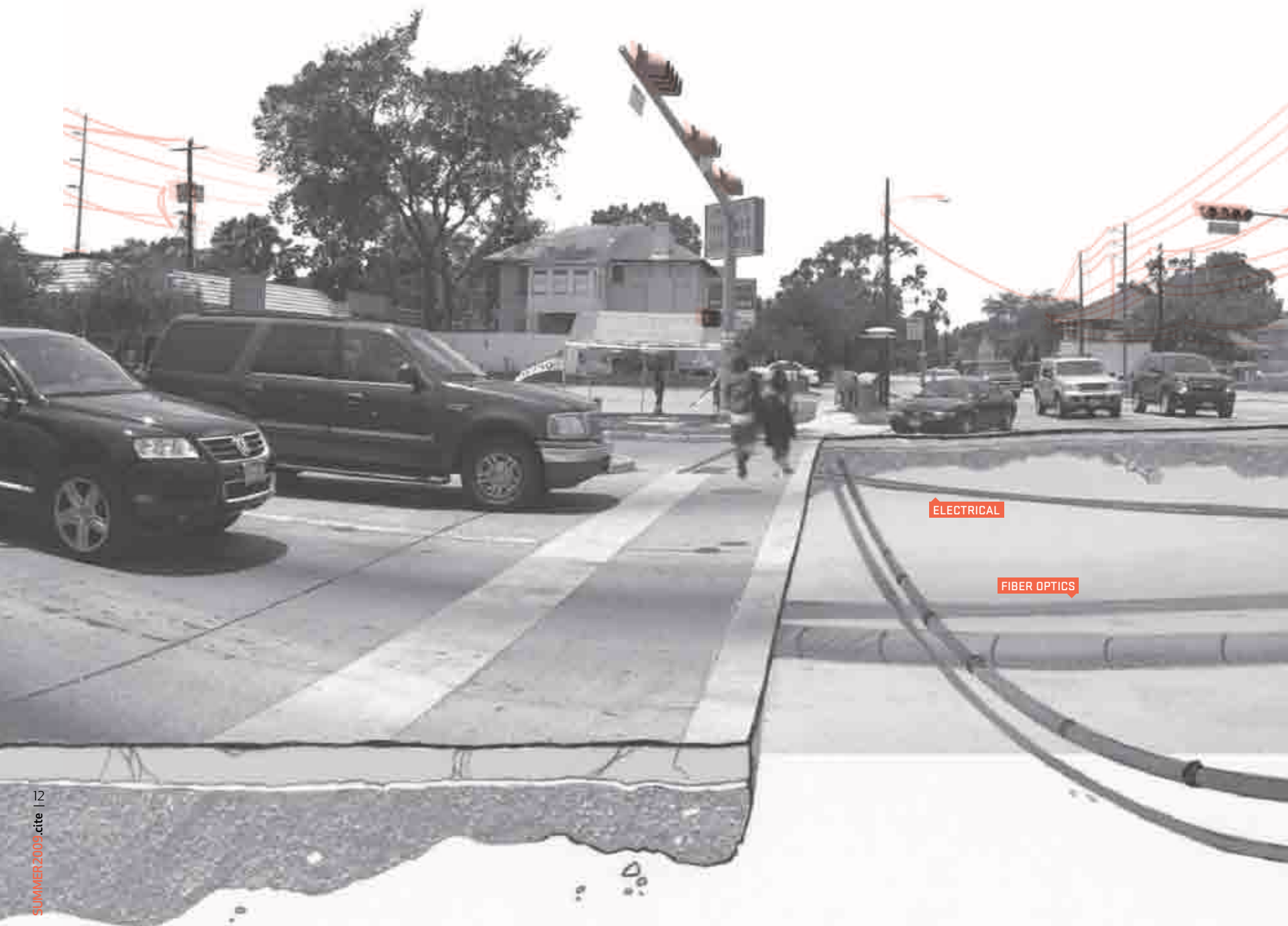
ILLUSTRATION OBIE AND SALLY DÍAZ