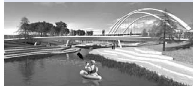
Rendering, View of Margaret McDermott Bridge from the Trinity River.

FEW U.S. CITIES ARE MATCHING THE LARGE-SCALE INVESTMENT OF CULTURAL AND FINANCIAL CAPITAL THAT DALLAS IS MAKING IN ITS PUBLIC ARCHITECTURE AND INFRASTRUCTURE.