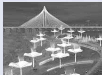
Rendering, Margaret Hunt Hill Bridge.