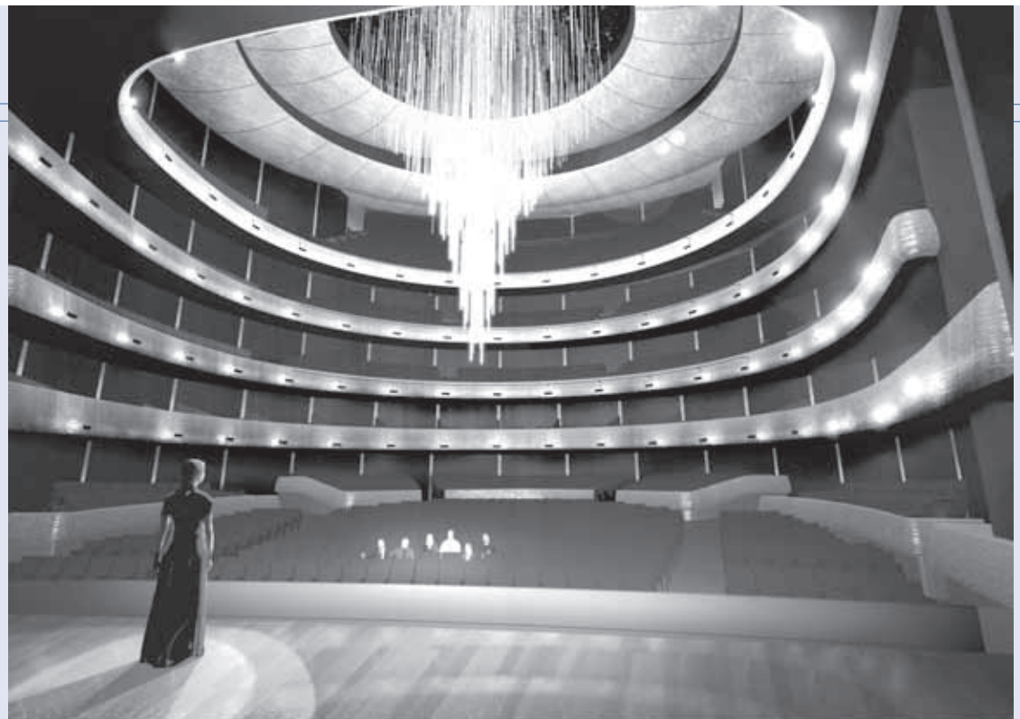
Rendering of Margaret McDermott Performance Hall at the Winspear Opera House.

A restaurant, café, and possibly even a bookstore will remain open throughout the day in order to welcome both opera patrons and general public into the building. A clear glass façade can be raised like a garage door on the east side of the Opera House, where the café and the restaurant are located. The reflective red panels and the rounded contours of the auditorium echo the dramatic baroque draperies typically employed for theater stages. I. M. Pei & Partners' Morton H. Meyerson Symphony Center (1989) to its west also rethinks in abstract terms the sculptural quality of