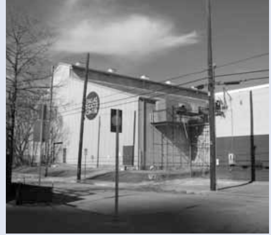
ABOVE: Dallas Theatre Center formerly on the Arts District site. LEFT: Construction before cladding.