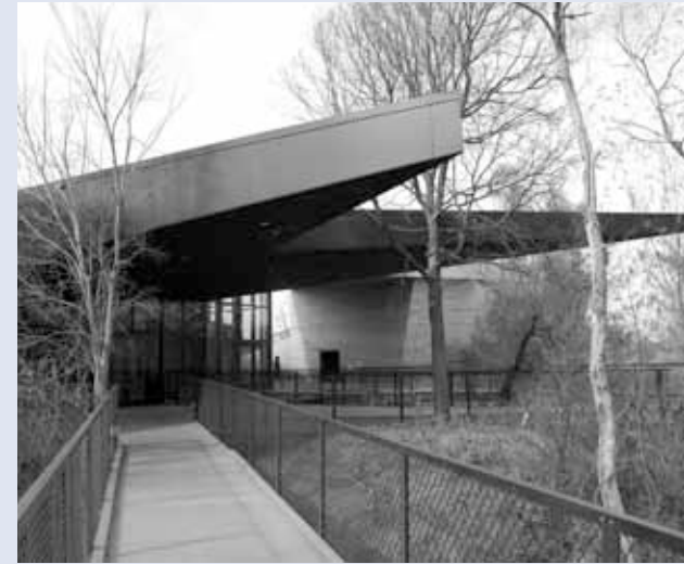
BELOW: Entrance facing Trailhead Pond. BOTTOM: Site plan.

Although the proximity of different arts institutions along Flora Street recall the Lincoln Center in New York, designed in the 1960s by a number of distinguished architects for related yet distinct organizations, it lacks the overall density of its Manhattan counterpart. This should not come as a surprise given the differences between the two cities. One can look closer to home to see that the trend toward the campus model is shared by other arts districts. Fort Worth has developed an arts district of its own with Philip Johnson’s Amon Carter Museum (1961), Louis I. Kahn’s Kimbell Art Museum (1972), Tadao Ando’s Modern Art Museum of Fort Worth (2002), and a number of other cultural institutions all in close proximity. The