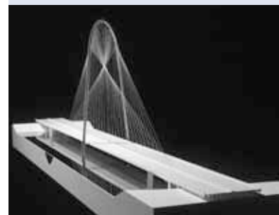
Model, Margaret Hunt Hill Bridge.