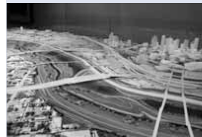
Bird's eye view of the Trinity Corridor Project Model.

Fundamental to the Trinity River Corridor’s regenerative-type role are two freeway bridges designed by Santiago Calatrava. The first of these, the Margaret Hunt Hill Bridge whose completion is expected by 2010, is an airy and elegant tensile structure. Extending the Woodall Rodgers Freeway across the Trinity to Singleton, West Dallas. The second of the bridges, the Margaret McDermott Bridge, will carry U.S. Interstate 30 connecting Dallas and Fort Worth. With their lofty sculptural forms, these two bridges will provide visual markers that can be seen from the distance and will no doubt draw residents and tourists alike to the recreational and entertainment spaces of the Trinity River Corridor.