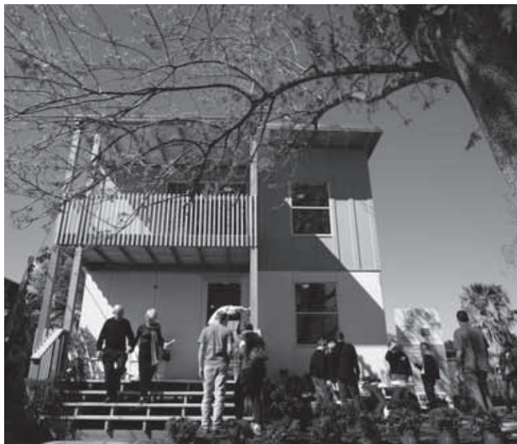
Tour goers on the patio of the 99k House, under construction by Harvey Builders.

Harvey Builders managed to nearly complete the 99K House in 99 days. Though renderings have