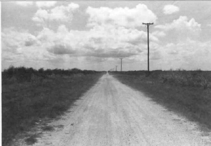
Near Riviera Beach. Photo by Barrie Scardino, 1997